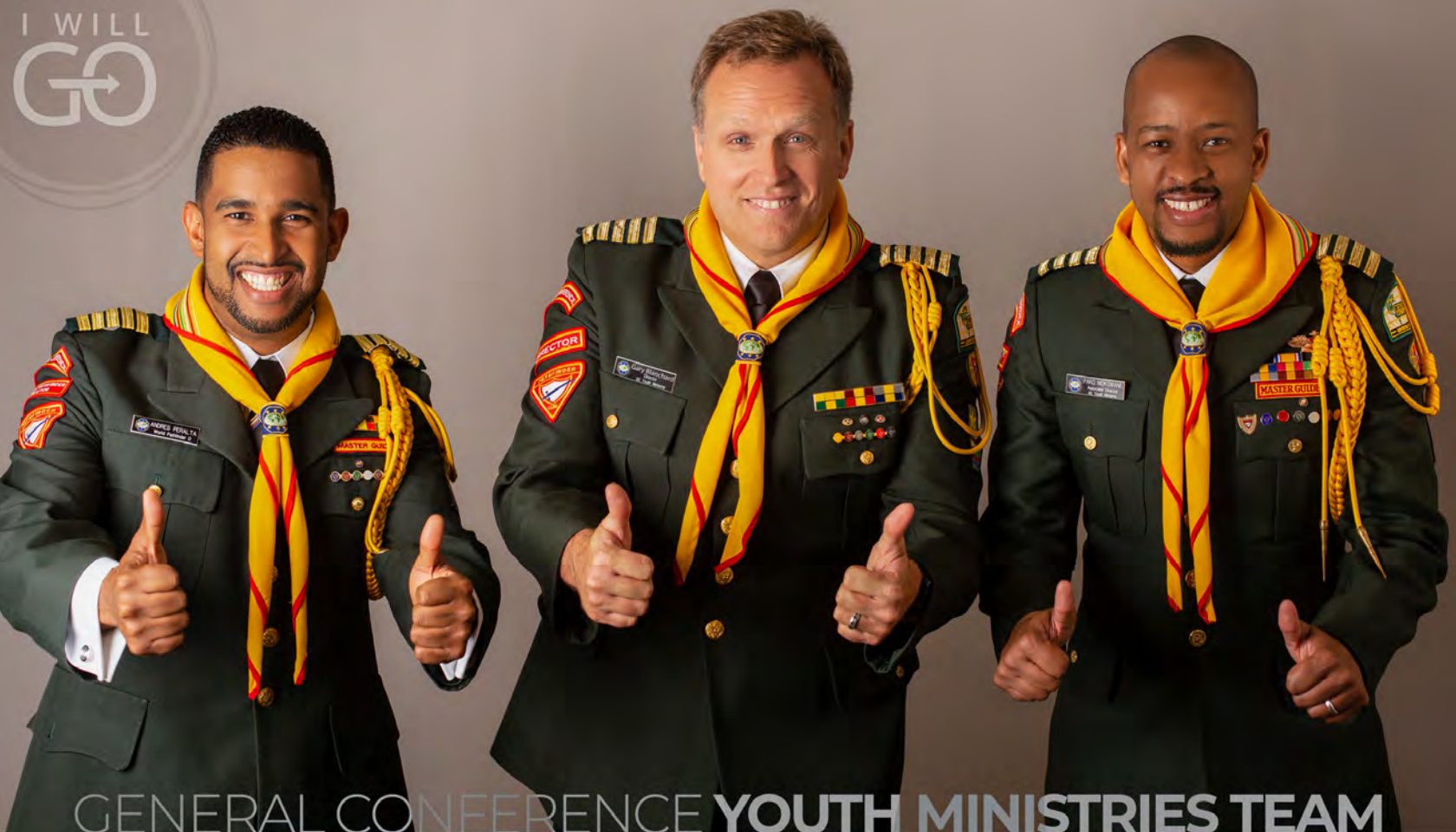
GENERAL CONFERENCE YOUTH MINISTRIES TEAM